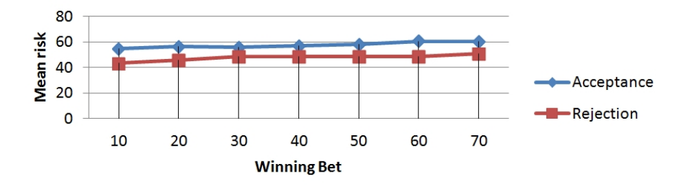
Figure 4. Mean risk in each round - loss aversion lottery choice

secure and less confident about their sources of information will have a greater propensity to herd. This feeling of uncertainty is a characteristic of each individual, since it will depend on each individual's attitudes, their more or less intuitive character, their risk propensity, their excess or lack of confidence, their illusion of control, their degree of tolerance for ambiguity, and so on.