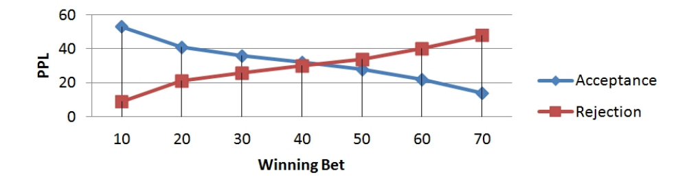
Figure 3. Number of people in each choice option - loss aversion lottery choice