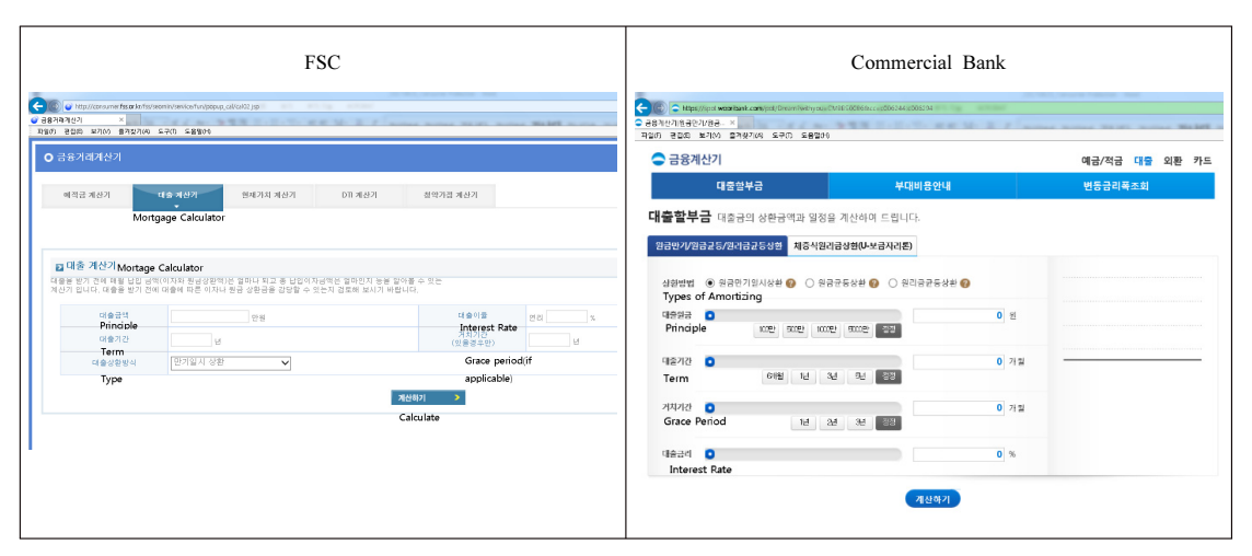
Figure 3. Mortgage Financial Offered by FSC and Commercial Banks

Note: the English translations were added by the authors.